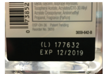
OCV & Match Code