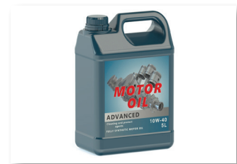
Presence & Position

Industries Served: Personal Health Care, Food & Beverage, Household Chemicals, & more.