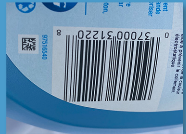
1D & 2D Codes