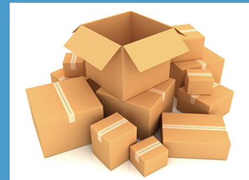
Flap & Seal Integrity